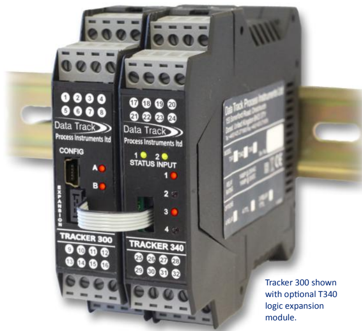
Tracker 300 shown with optional T340 logic expansion module.

For Signal Conditioning, Data Acquisition, PID Control and Alarms